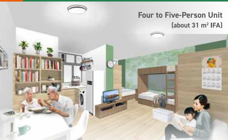
Four to Five-Person Unit (about 31 m 2 IFA)

Note 1: The size, design and layout of the unit, decorations, furniture and electrical appliances in the artist's impression are for reference only.