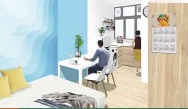
One to Two-Person Unit (about 13 m 2 IFA)