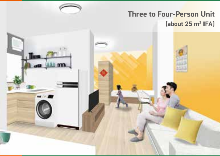
Three to Four-Person Unit (about 25 m 2 IFA)